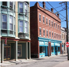
Golden Street New London, CT